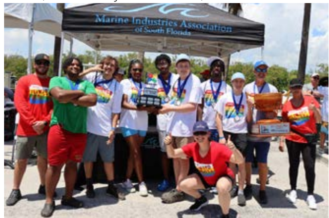
Winning Plywood Regatta team celebrating and posing with their FLMC Sponsored trophy and medals.