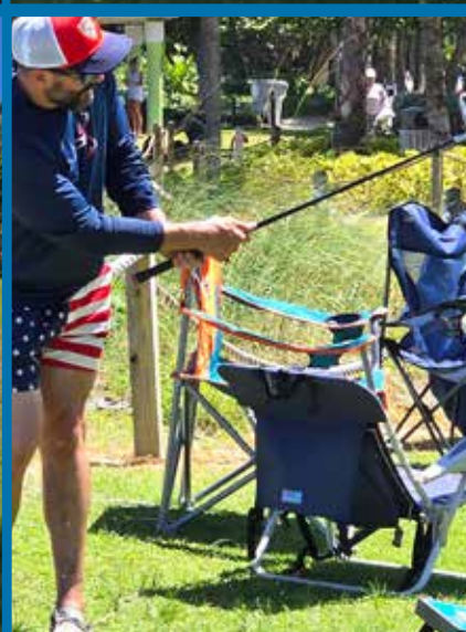
Page 4: The Family Beach Day had games like corn hole, good BBQ and the Club's "secret sauce" of good conversations between old and new friends.