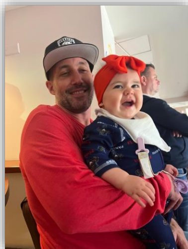
November 10, 2023 Panther's Game ↘