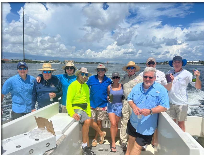
FLMC September Offshore Fishing Trip ↑